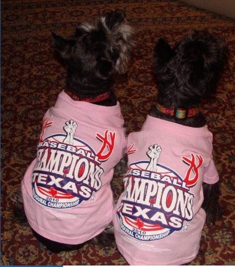
Cricket and Lola showing their Texas Ranger pride!

We help change lives, for the better,” said another foster Mom. Foster parents also continue to get “warm fuzzies” when they hear from an adopter months later through emails or see a “Happy Tails” story sent to MSRNT.